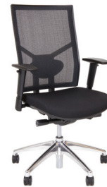
Featured with optional lumbar and polished aluminium base