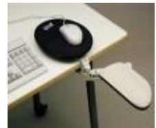
long pad, mouse