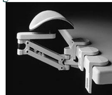
Standard and wide jaw