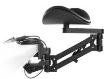
ESD Standard 74E338000