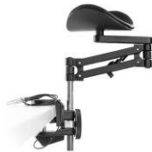
ESD High 74E339000

The Ergorest ESD 338 000 (Std) and ESD 339 000 (High) provide effective protection against electrostatic discharge at two support heights. Thanks to their ESD protection, the supports are excellent for use in the electronics industry. Product ID: 339000 is suitable for tasks which demand precision, such as assembly stations. The supports are entirely conductive and coated with long-lasting and conductive imitation leather.