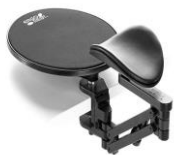
with Mouse pad 74E350