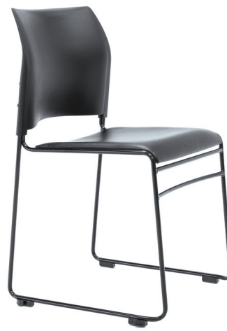
Maxim Black - Black Powder Coat Frame 2