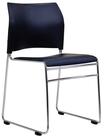
Maxim Black - Chrome Frame