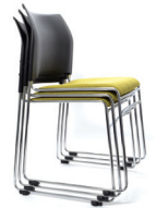
Maxim Black - Chrome Frame with Custom Seat