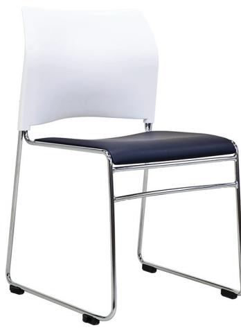
Maxim White - Chrome Frame