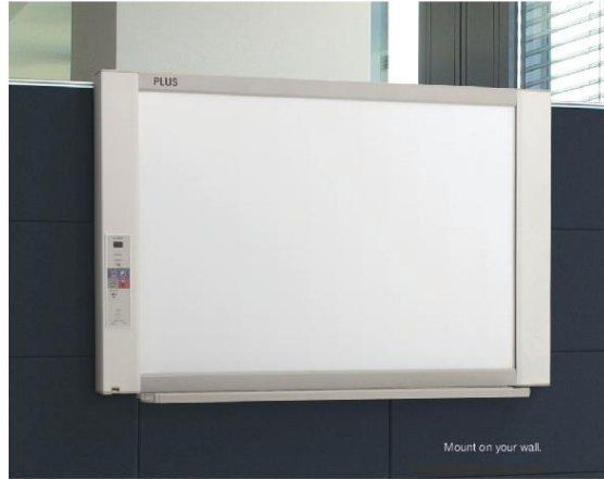
Mount on your wall.