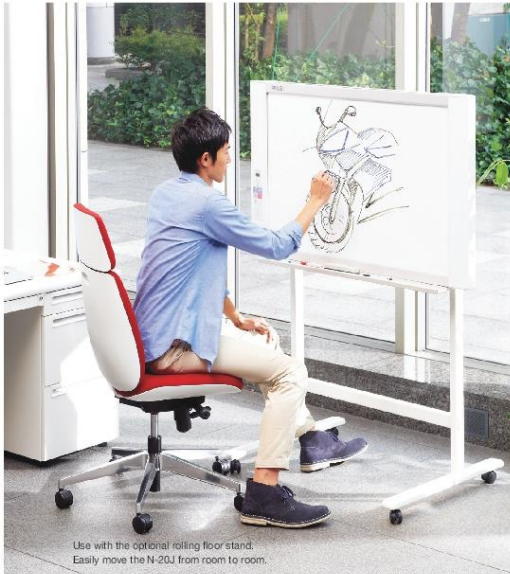
Use with the optional rolling floor stand. Easily move the N-20J from room to room.