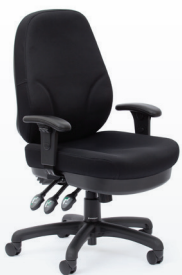
PLYMOUTH OPTIONAL ARMS