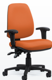
QUAD HIGHBACK OPTIONAL ARMS