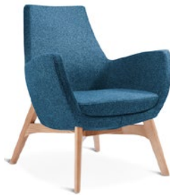
Natural timber leg.