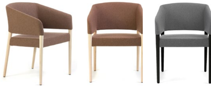
Natural timber leg.