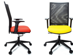
Featured in customer specified upholstery.