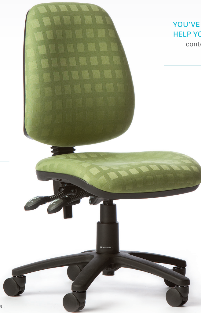
Covered in Cubic Green

Our reinforced nylon/fibreglass star bases are EXTRA STRONG AND TESTED TO 1130KG.