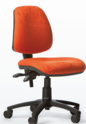
QUAD 2 MIDBACK