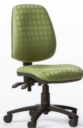
QUAD 2 HIGHBACK